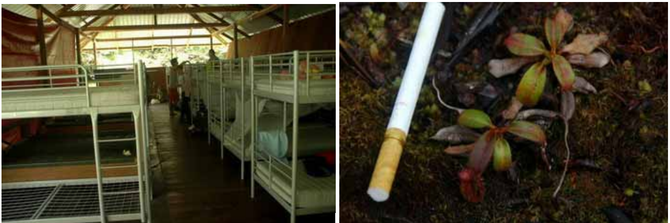
Ginseng Camp sleeping area / World smallest Nepenthes plant species

Day 6 Go Home: After breakfast, we depart by 4WD back to Tawau 300km 5hr. It will a late lunch/early dinner meal. We wander around Tawau market for some shopping. Dried seafood is good value here. We rejoin our vehicle which takes us to the Tawau Airport. Depart 0700PM and arrive 0945PM.