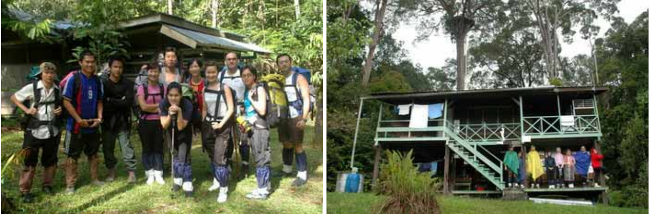
Start at Agathis Camp / Camel Trophy Camp

Day 3 Ginseng Camp: The trek to Giluk Falls is 30 min one way. We spent some time taking photos before returning to Nepenthes to pickup our backpacks for a 6.5km 4-5hr trek to Maliau Junction, then another 1km 1hr to Ginseng Camp, passing through beautiful heath forest and moss-covered ground, with abundance of wild orchids and pitcher plants - a photographer's paradise. There are virtually no trees with diameter exceeding two inches as the soil is thin and nutrient-deficient. We are now in the midst of what is know as the "Lost World of Sabah". This is a raised camp with excellent facilities - flushed toilets, cold showers, big kitchen and dining areas, bunk beds with mattresses and generator lights.